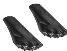
Pole tips rubber with 2 mm studs.